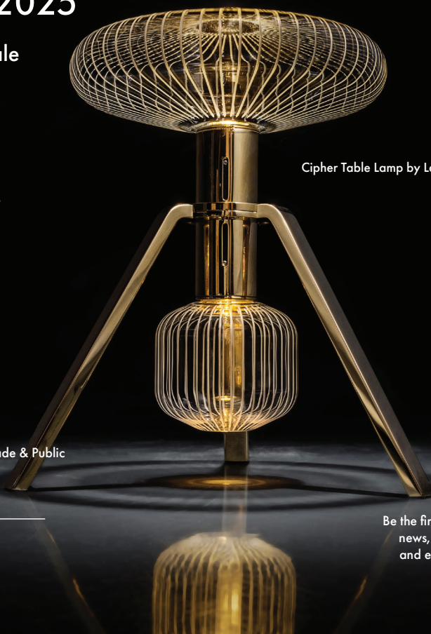
Cipher Table Lamp by Lasvit, Minotti by HA Modern