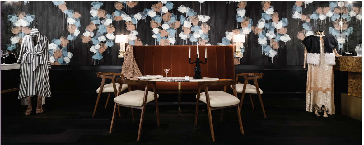
Design Credit: Shayelyn Woodbery Interiors

As we celebrate the evolution of design, a revitalization of ADAC: BEHIND THE WINDOWS was only fitting. This year's featured designers reflect ADAC's growth and expansion, and, with their own design offices located on campus, they exemplify the core of our community. The vignettes showcase how top design talent use ADAC products, with one designer also incorporating product from AmericasMart, our sister property, in two vignettes, one on each campus, reminding us that you don't have to go far to find the essential elements of luxury that have always been the foundation of fine design.