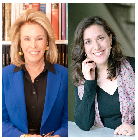
5:00 PM ET A House for All Occasions Tour