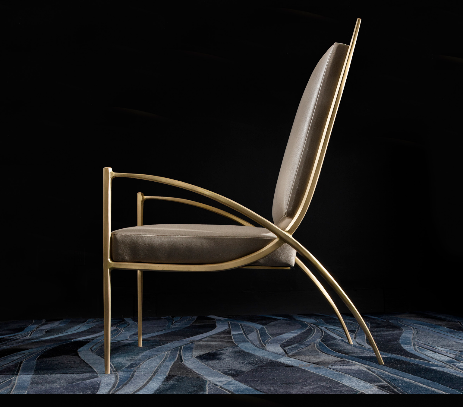
Marcel Lounge Chair from Ironies | Jerry Pair, Suite 508/412 Seaside Hide Rug | Moattar, Suite 314