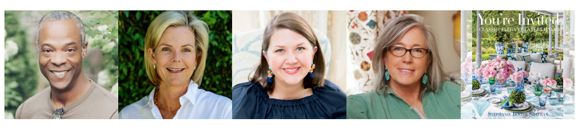
10:00 AM ET Decorating with Florals Panel Discussion