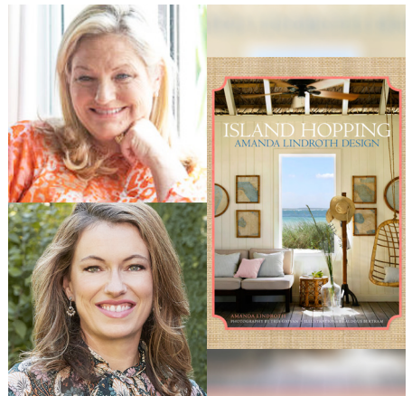
11:00 AM ET Elegance with Ease Keynote Presentation