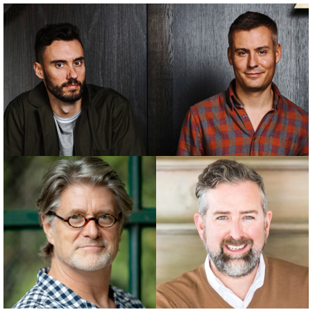
11:00 AM ET Natural Connections Panel Discussion

@abranca | @tonybaratta | @verandamag | @jimthompsonfabrics | JIM THOMPSON