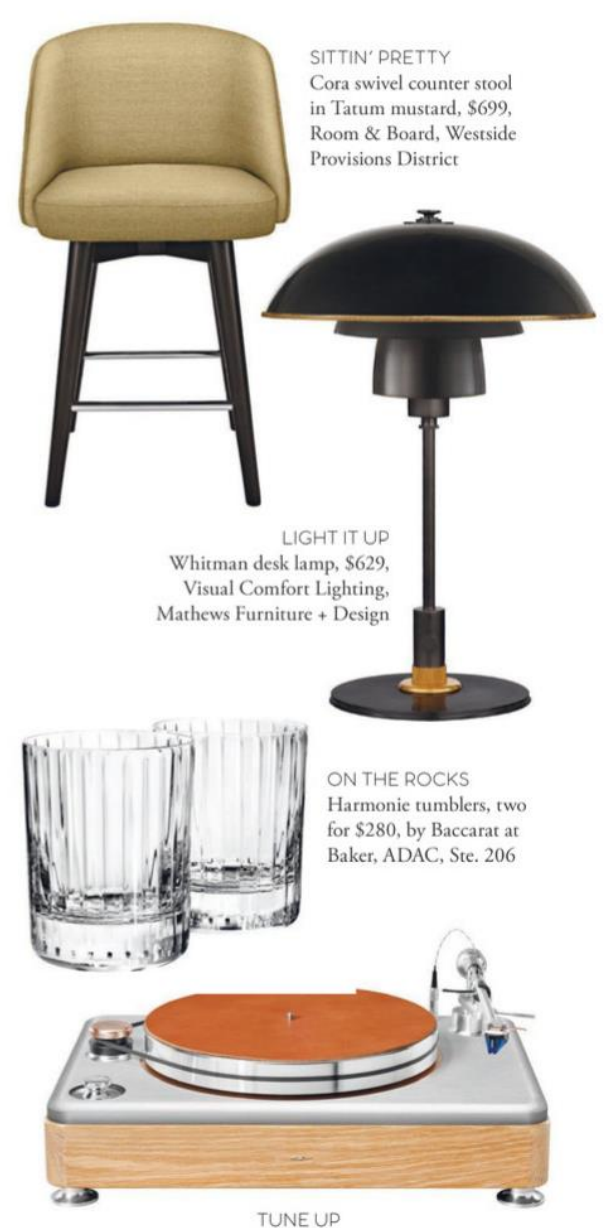
Runwell turntable, $2,500, shinola.com